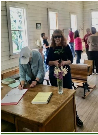
Turning in homework.