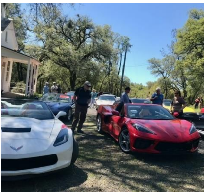
TOO COOL FOR SCHOOL!