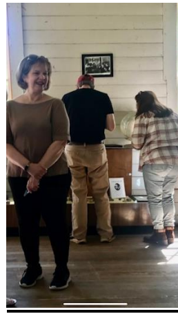
Waiting for recess.