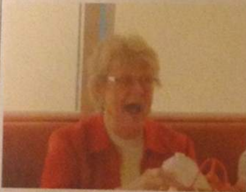
Sometimes being last ain't all bad