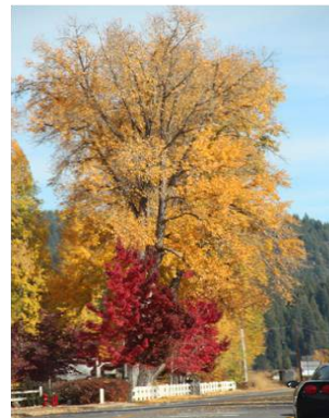
Indian Valley Museum in Taylorsville