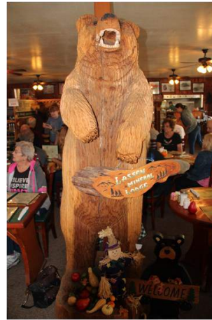
A big bear greets us at the Lassen Mineral Lodge Restaurant