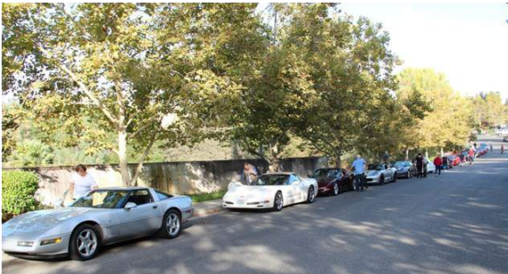
Meeting up near Canyon Oaks Country Club