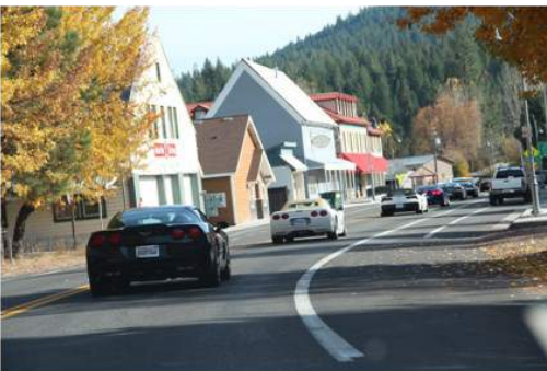
Passing through Greenville on HWY 89