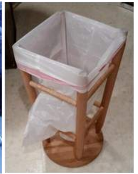
Stool as trash bag holder