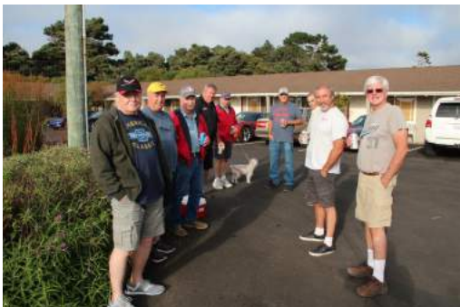
Gentlemen of the Corvettes