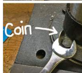
When you don't have the right size wrench