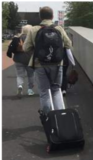
Use your backpack straps for hands-free carry-on luggage