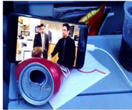
Impromptu soda can phone stand for the long flight home