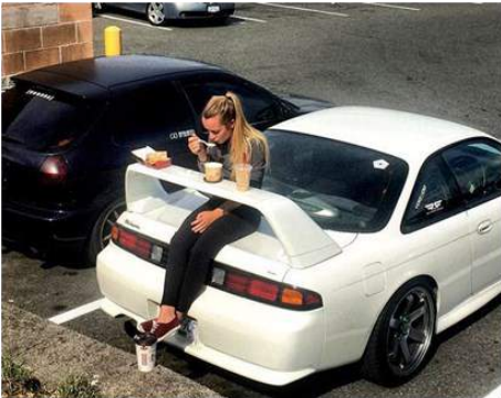
Use your car's spoiler as a picnic table