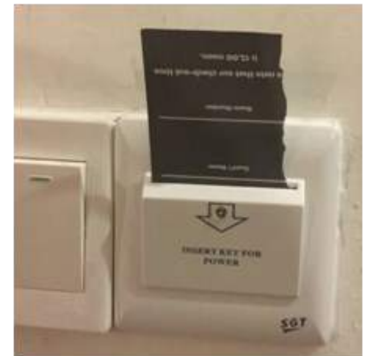
If your hotel room requires you to insert your key for power, you can put any piece of paper into the slot