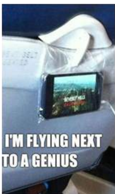
Phone in baggie on plane's tray hook