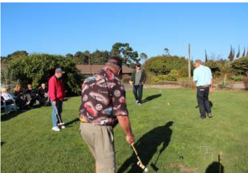
Hey, they play croquet!