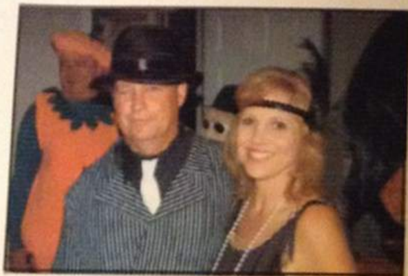
Another gangster and his moll