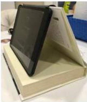
Hardcover book to prop up a tablet