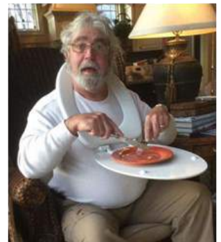
New TV tray